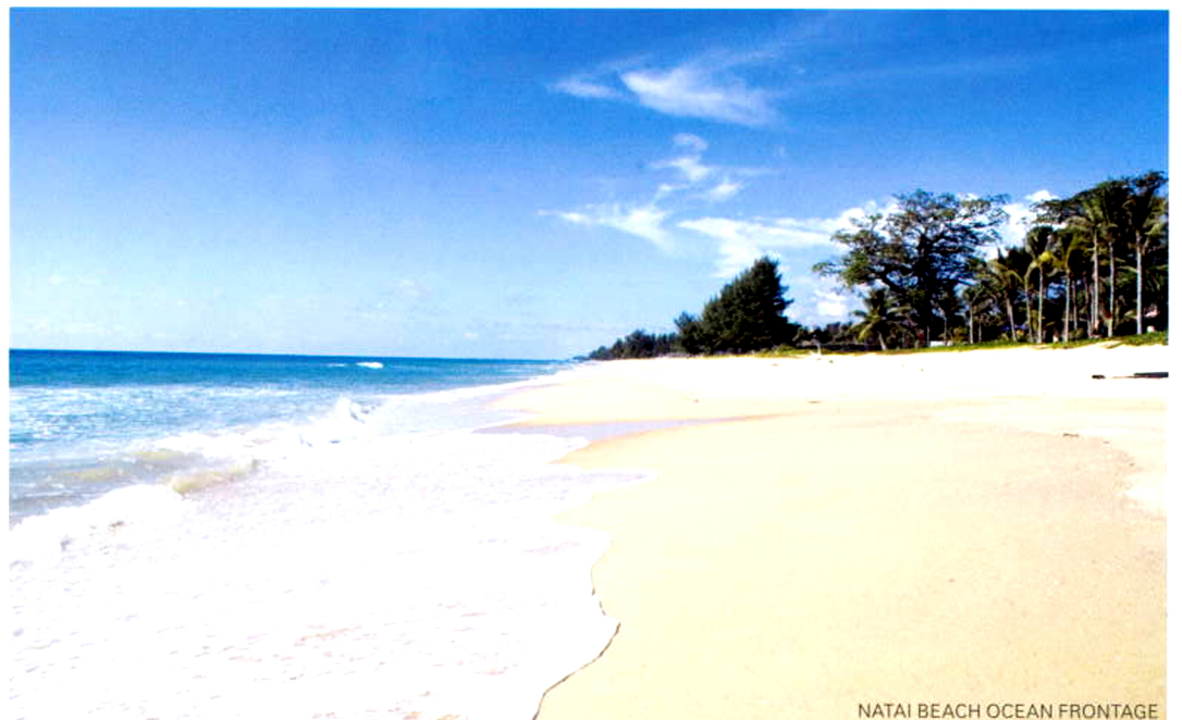
NATAI BEACH OCEAN FRONTAGE