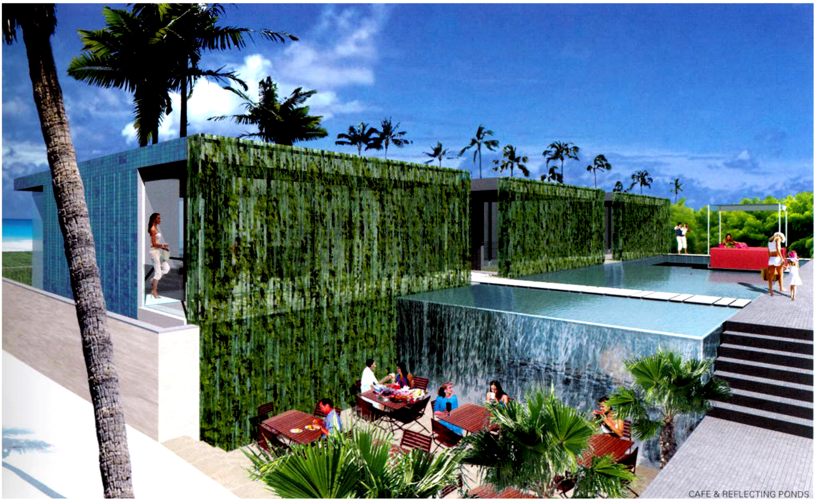
CAFE & REFLECTING PONDS

Studio has freely transplanted technology and techniques perfected elsewhere and joined with local experts to create an eco-friendly sophisticated luxury estate with a delightful small café and sophisticated pool area.